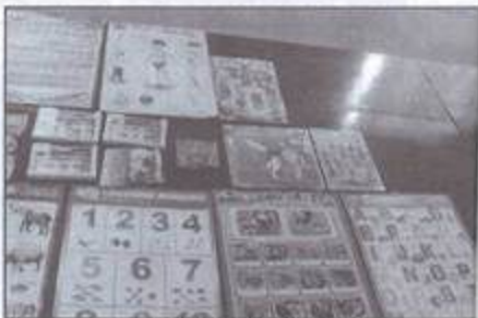
Pre School Study Materials

Preschool study materials worth of Rs.2,000/- were given to the Preschool at "Y" Village, Iyakkachchi.