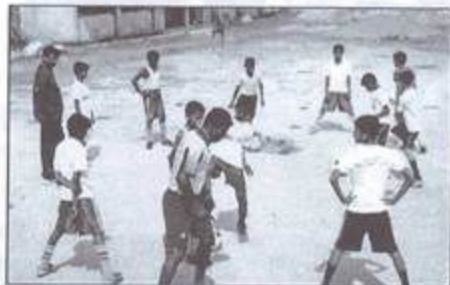
Students at field