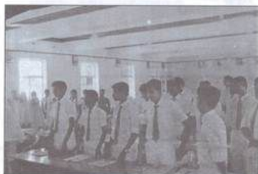
Leadership Training Seminar in Progress