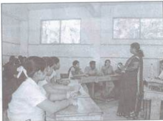
Bible Quiz Competition - Zonal