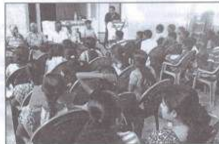
Leadership Training Seminar - Closing Ceremony