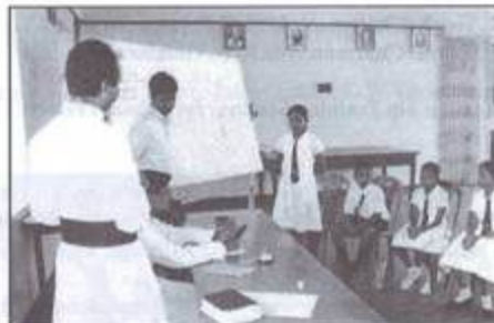
Bible Quiz Competition - Regional

A Cash prize was given by the Jaffna YMCA . First place - Rs.1000/=, Second place - Rs.750/= and Third Place - Rs.500/=, 168 Youth & Children benefited by the Religious activities.