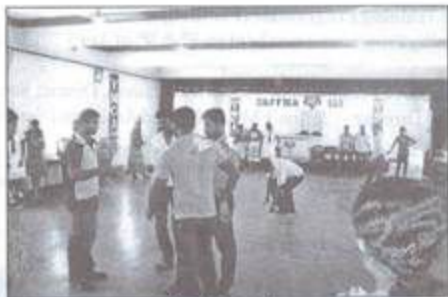
Youth in action