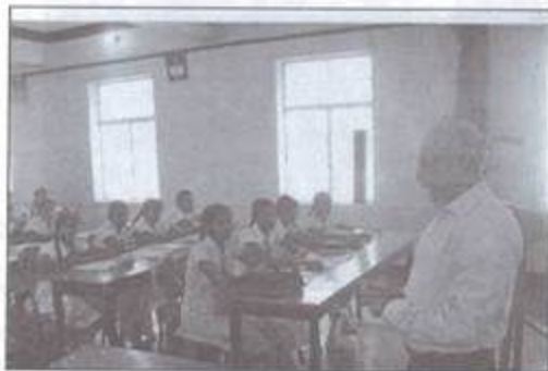
Leadership Training Seminar - Participants