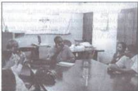
Handing over the gift packets