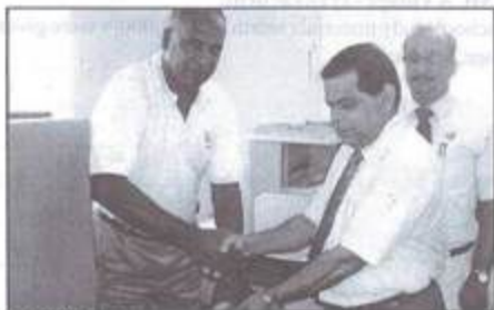
Distribution of Wheel Chairs