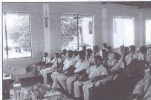
Participants at the Seminar