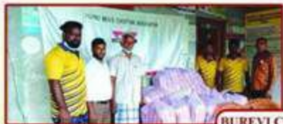
BUREVI Cyclone Relief