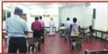
World Week of Prayer