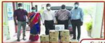
Covid 19 Relief