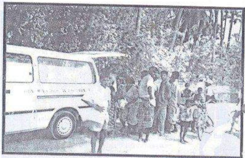
Relief Work at Kudathanai