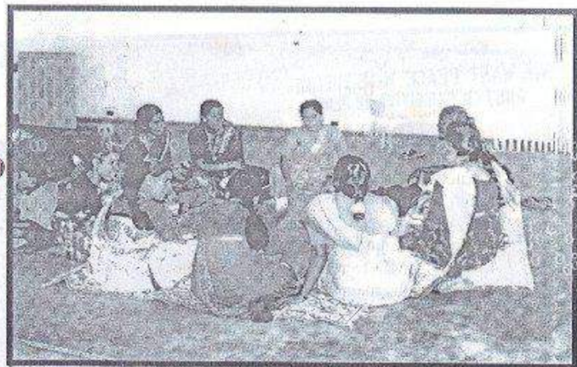
Mothers at Group Discussion