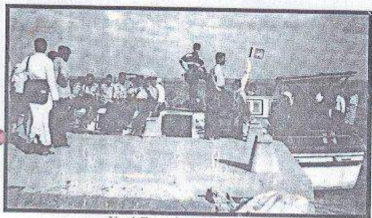
Youth Excursion to Fhuvaithcevu