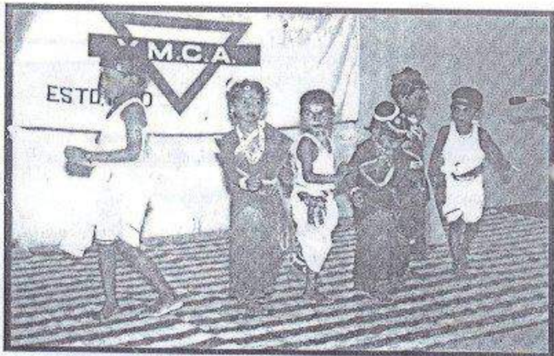
C.D.P. Cultural Day Celebration