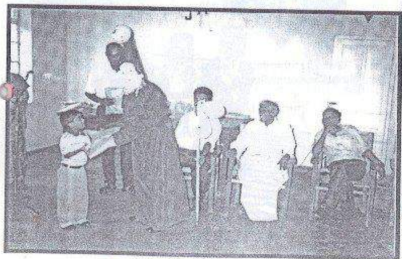
C.D.P X' Mas Programme