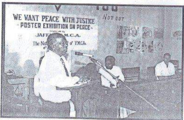
Poster Exhibition on PEACE